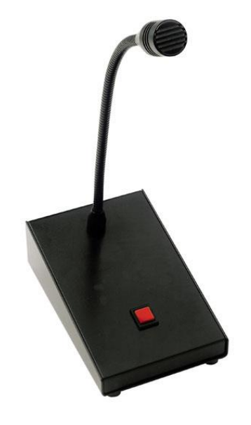
Illustration shows D 43 microphone

The DMB 1 is designed to be used as part of a paging microphone system for easy use in all types of industrial, entertainment and commercial environments.