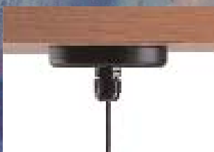
CP73 CEILING PLATE

Diameter 74mm Height 14mm fitted with locking cable gland