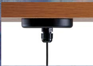
CP73 CEILING PLATE

Diameter 74mm Height 14mm fitted with locking cable gland